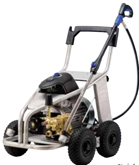
Stainless steel version