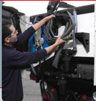
Tank filling is fast and simple thanks to the rear hose fitting