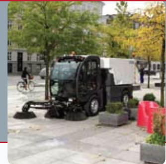
Robust design for cleaning city centres, pedestrian streets, large parking areas, etc.