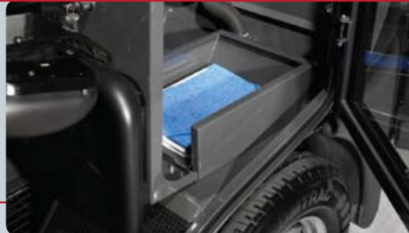
The passenger seat tilts to permit additional storage space