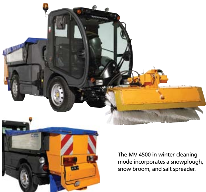
The MV 4500 in winter-cleaning mode incorporates a snowplough, snow broom, and salt spreader.

That same street washer that was used to clean the streets and sidewalks, can also be used as a sweeper to keep the city's roads and parking areas free of trash and debris. In between times it is used as an all-purpose pick-up vehicle. Now, in just a few minutes it converts into a snowplough for winter cleaning. The MV 4500 is truly an all-season performer.