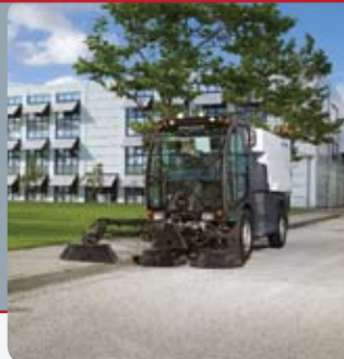
Third broom system is activated with joystick control