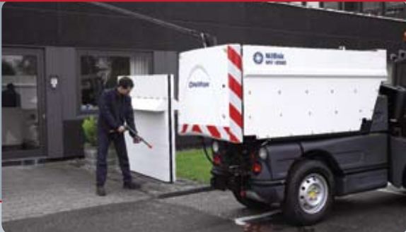
Road signs and pavement can easily be cleaned using the flexible water gun