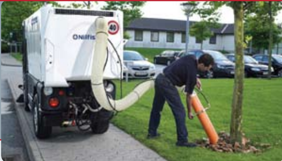
Extra hose fitted as standard for vacuuming leaves etc.