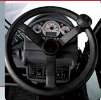
The well-designed dashboard and adjustable steering column adds both safety and comfort