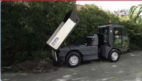
All materials, up to 1,800 kg, are easy to transport and easy to empty with the MV 4500