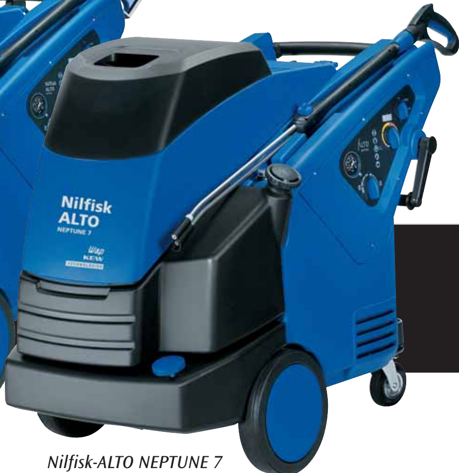
Nilfisk-ALTO NEPTUNE 7