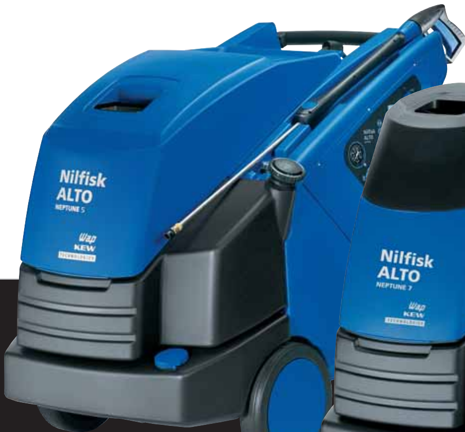
Nilfisk-ALTO NEPTUNE 5

Fuel and Detergent A fill openings are conveniently located on the operating side of the machine, and at the right height to make re-filling easy.