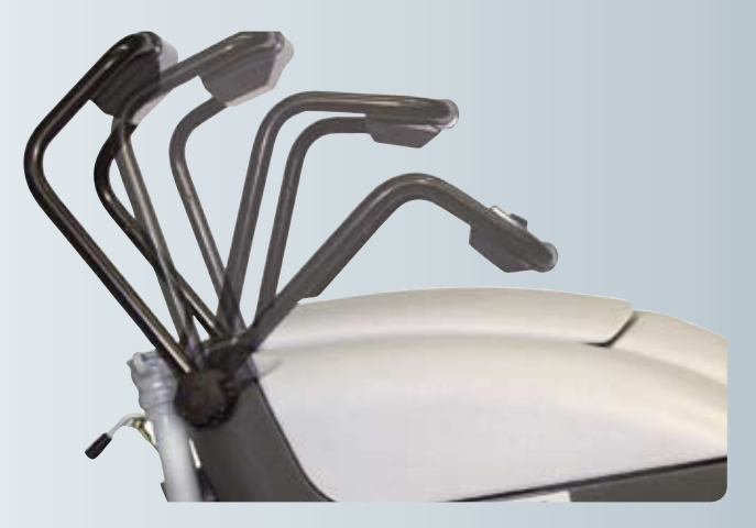
The operating handle is fully adjustable for comfort and efficiency. It can also be folded away for parking and storage