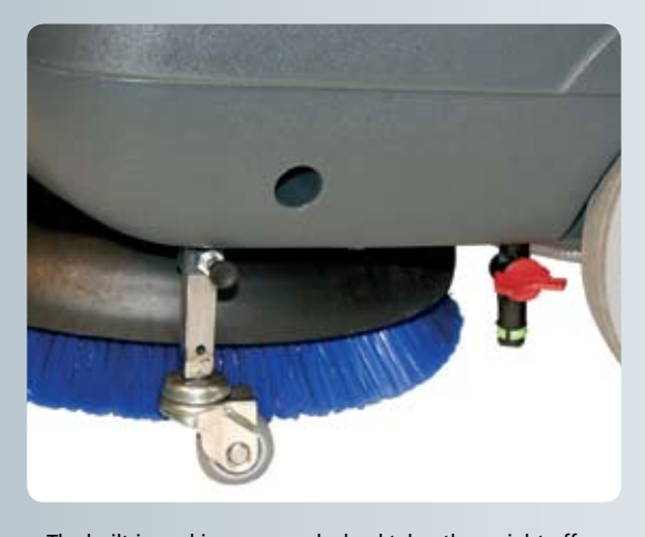
The built-in parking prop and wheel takes the weight off the brush and supports the machine when parked