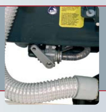
The unique ECO mode system saves water and reduces chemical usage. It also allows the machine to be used longer between tank refills