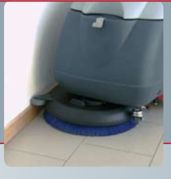
The offset brush deck with side wheel permits efficient close-up cleaning without damaging walls and furniture