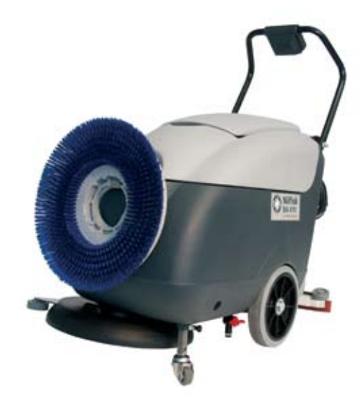
A built-in hook protects the brush from possible damage during transportation between cleaning locations.