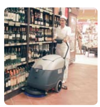
The machine is supplied in battery or cable versions. Both versions feature the ECO water and chemical saving concept and are suited to a wide variety of institutional or commercial applications