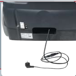
The plug-in onboard battery charger ensures continuous and hassle-free operation.