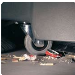
Patented vertical flap allows one path collection of large debris (SW 850S)