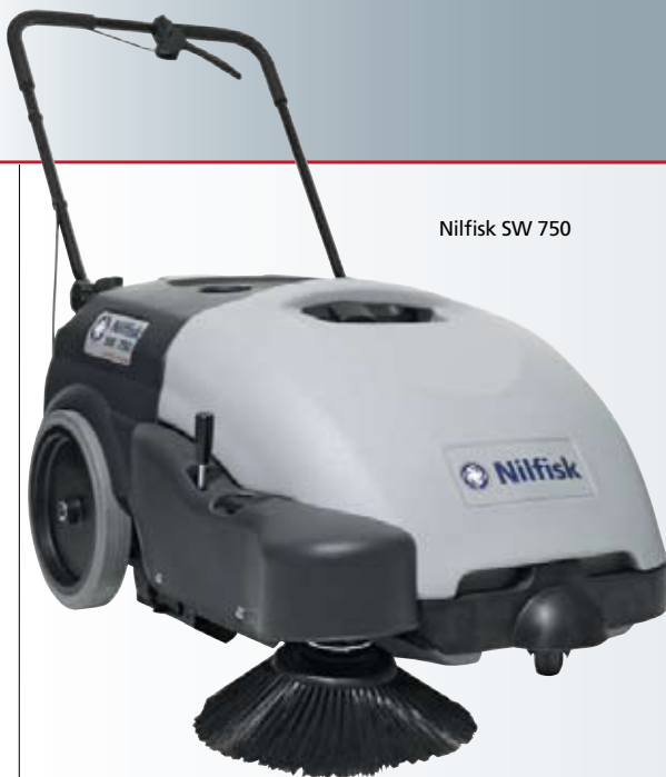
Nilfisk SW 750

Moreover, it cleans so silently that it can be used even in the most noise sensitive areas. At just 59dba, the SW 750 is suitable for daytime cleaning without risk of causing disturbance. In fact, the entire design is so efficient, and so cleverly thought-out, that productivity is assured even with an inexperienced operator, while operating costs are minimized.