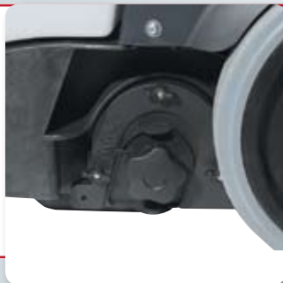
The main and side brushes are adjustable to ensure perfect pressure on the floor at all times and in all conditions.